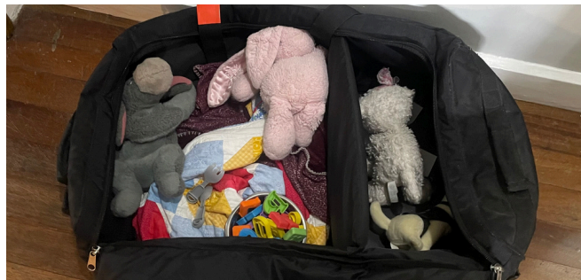
Elise "helped" me pack.